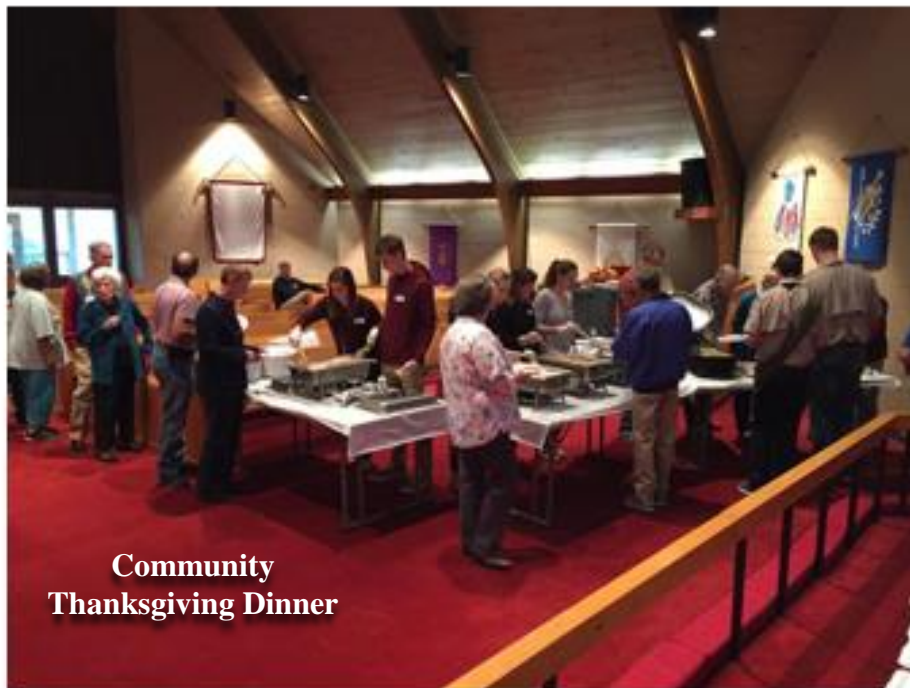
Community Thanksgiving Dinner