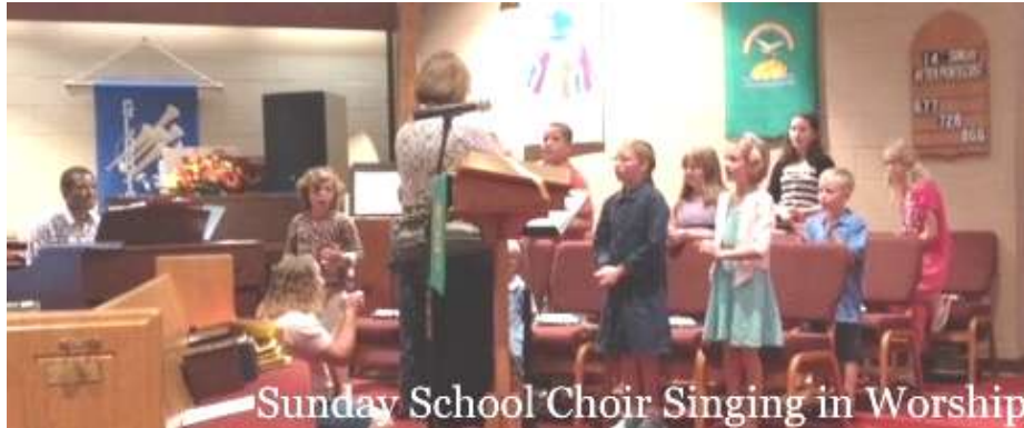
Sunday School Choir Singing in Worship