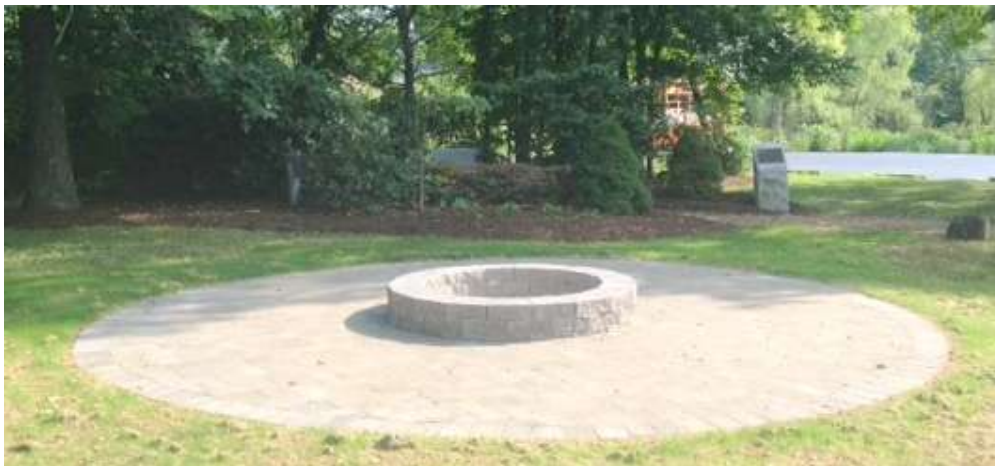
Circle of Grace