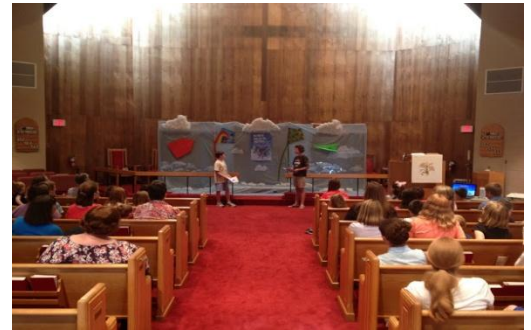
Vacation Bible School