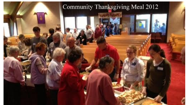
Thanksgiving dinner for the community