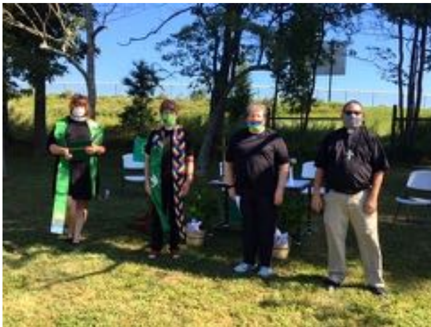
Drive in Sunday Service July 26, 2020