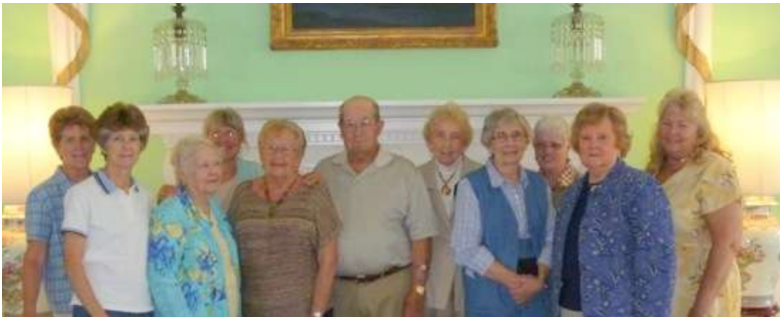
O.K. Trip to the Greenbrier Resort and the “Bunker” in May