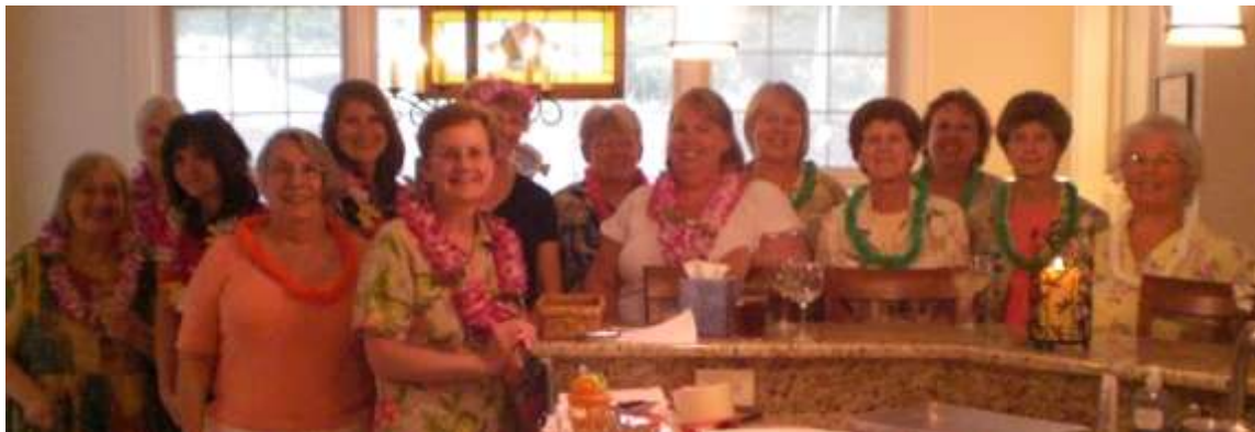
The ladies at the Ladies Luau on July 15.